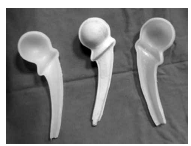
Figure 2. Template for spacer and mobile hip spacer.

Biological activity of PBS samples containing the antibiotics eluted from the spacers were tested against Staphylococcus aureus strain sensitive to vancomycin