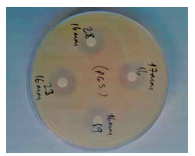
Figure 3. Example of inhibition zone for disc diffusion.