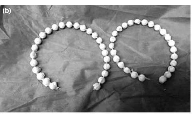
Figure 1. (a) Bone cement bead template. (b) Bone cement beads.

monomer was added. Samples were molded once in dough form. For MHSs prepared in alternative fashion, antibiotics were added after liquid monomer and PMMA powder were mixed and bone cement was in dough form, after which the spacer was molded.