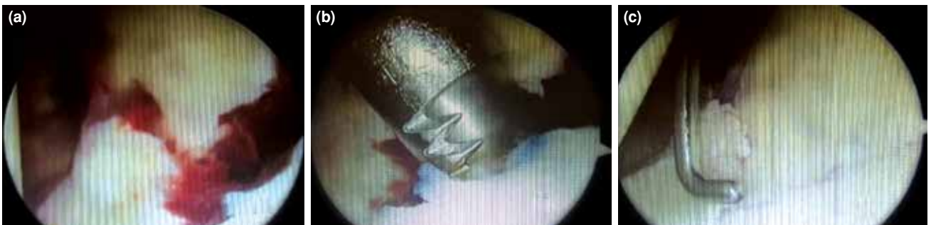
Figure 2. Peroperative images: (a) View from posterior portal of fracture, (b) debridement of small fragments, (c) view of fracture line after fixation.

the articular surface was evaluated (Figure 2a). Further, the anterior portal was made under direct visualization. The fracture line was palpated using an arthroscopic hook probe to mobilize small fragments followed by removal of all intra-articular and interposed bony fragments using an arthroscopic shaver (Figure 2b). Once the debridement was completed, the superior fragment was examined with a probe to investigate if an anatomic reduction is possible. After confirming the possibility of an anatomic reduction, the Neviaser portal was made in the notch between the posterior acromioclavicular joint and the spine of the scapula. Next, a 3-mm Kirschner wire (K-wire) was inserted from this portal and advanced from the superior glenoid rim under fluoroscopic imaging. The superior glenoid fragment was reduced using a K-wire inserted from the Neviaser portal under direct visualization once the anatomic reduction was achieved; the K-wire was advanced into the inferior glenoid. The two cannulated screw guidewires were placed again from the Neviaser portal from the anterior and posterior regions of the K-wire under fluoroscopic imaging to avoid passing into the far glenoid cortex.