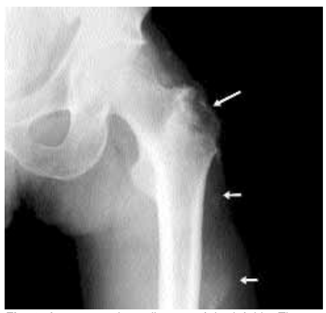
Fig. 1. Anteroposterior radiogram of the left hip. The top (long) arrow indicates massive osteolytic lesion involving the greater trochanter. Short arrows indicate calcifications between the bone and the skin through the muscle planes.

A plain radiogram of the left hip and femur showed a massive osteolytic appearance involving the greater trochanter and multiple radiopacities distally through the soft tissue planes (Fig.