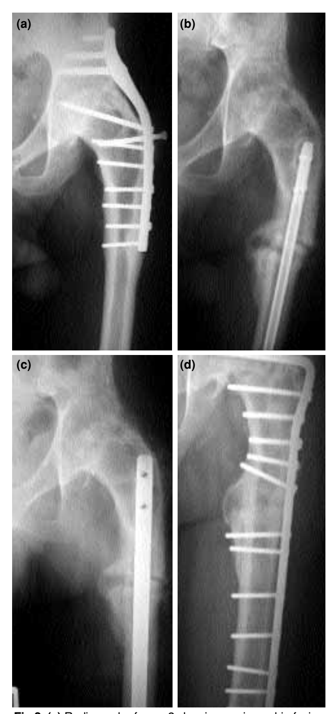
Fig 2. (a) Radiograph of case 2 showing a primary hip fusion with cobra plate. (b) Radiograph on presentation showing nonunion of a subtrochanteric femur fracture. (c) Radiograph following exchange of nailing and bone grafting of fracture site. (d) Radiograph after second operation showing removal of intramedullary nail and placement of a fixed angled device.

Case 3– A 49-year-old male who was 20 years status post-arthrodesis of the right hip for posttraumatic arthritis sustained a subtrochanteric femur fracture below the hip arthrodesis after a fall down five steps (Fig. 3a). The patient complained of right thigh pain, no other injuries were documented. He