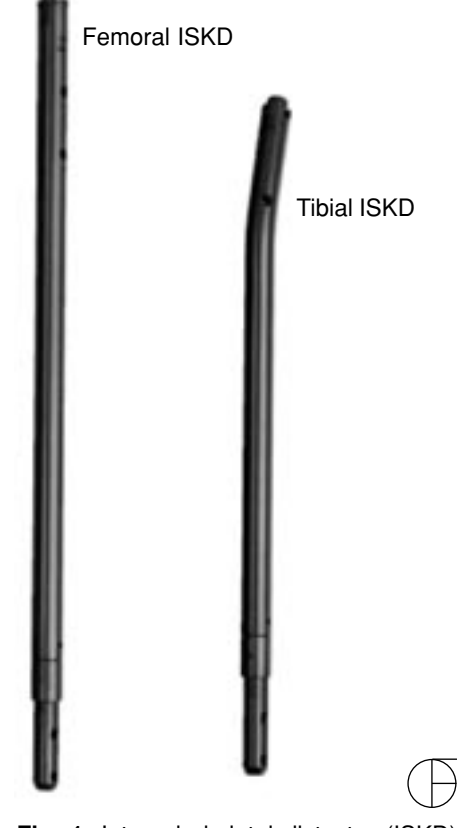
Fig. 1. Internal skeletal distactor (ISKD) implants for the femur and tibia.

A retrospective review was undertaken of all patients who underwent femoral lengthening using the ISKD device beginning September 2003 at our tertiary care center. The ISKD procedures were performed in accordance with the manufacturer's recommendations. All intramedullary devices were placed in an antegrade fashion through a piriformis starting point after the creation of the diaphyseal osteotomy. Osteotomies were created by making multiple drill holes in the diaphysis of the femur with a 3.5-mm drill. The drill holes were connected using an osteotome, and finally the completion of the osteotomy was confirmed to be complete with biplanar stress fluoroscopy. All limb lengthening