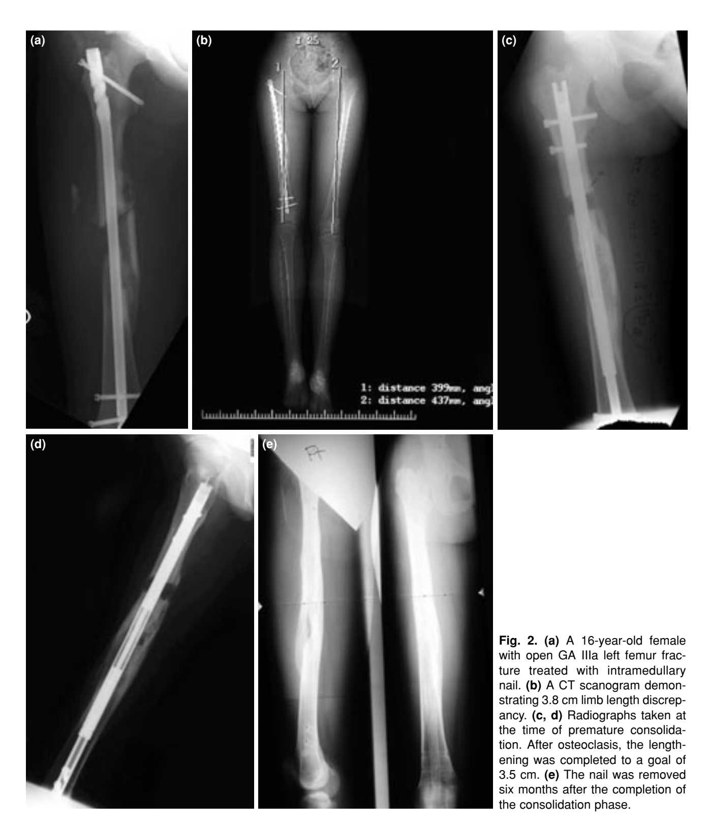
Eklem Hastalıkları ve Cerrahisi - Joint Dis Rel Surg