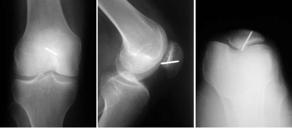
Fig. 3. (a) Follow-up radiograms at 1.5 years postoperatively.

A midline skin incision was used to provide access to the patella. The medial retinaculum was completely and lateral retinaculum was partially torn. To find the osteochondral free fragment, defect in the lateral retinaculum was extended proximodistally by sharp dissection and the patellar articular surface was exposed (Fig. 2a). The fragment measured 33x25x7 mm and had a very thin bony portion (Fig. 2b). The fragment was reduced anatomically and fixed using three K-wires placed parallel to the articular surface (Fig. 2c, d). During retinacular repair, adjustments were made to achieve a smooth patellofemoral tracking and to prevent subluxation. The knee was immobilized in a long leg brace for six weeks. Active and passive exercises were begun thereafter. Four months later, at a time when the patient was asymptomatic, he requested implant removal. Two of the K-wires were removed percutaneously under fluoroscopic control. The other one was buried deeply and retained for the sake of articular cartilage. At the latest follow-up 1.5 years after the operation, the patient had full range of motion, had no extensor lag or any complaint and had normal knee radiograms (Fig 3). He returned to his pretrauma activity level.