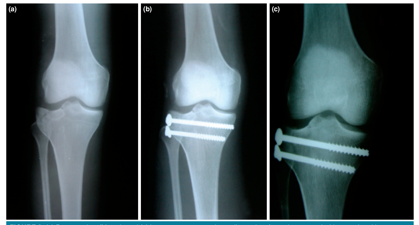
FIGURE 2. (a) Preoperative, (b) early and (c) long-term postoperative radiographs of a patient treated with cannulated lag screws.

Mean follow-up period was 34\pm4 months (range, 13 to 110 months). The mean lateral plateau diastasis in preoperative CT scan was 7.8 mm (range, 2 to 16 mm). The mean lateral plateau depression was 14.6 mm (range, 6 to 20 mm). Postoperative residual