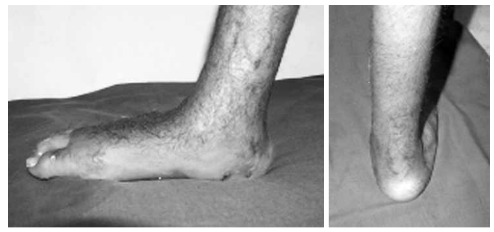
Figure 3. Plantigrade foot after correction (dorsal, medial and posterior view).

Another patient reported pain during the 20<sup>th</sup> month control. The pain increased with walking and working, but did not prevent daily activities. The pain being at the metatarsal heads, examination revealed that the fat pad had thinned at this area and a silicone sole was prescribed. The complaints were found to have significantly decreased in the postoperative 35<sup>th</sup> month control.