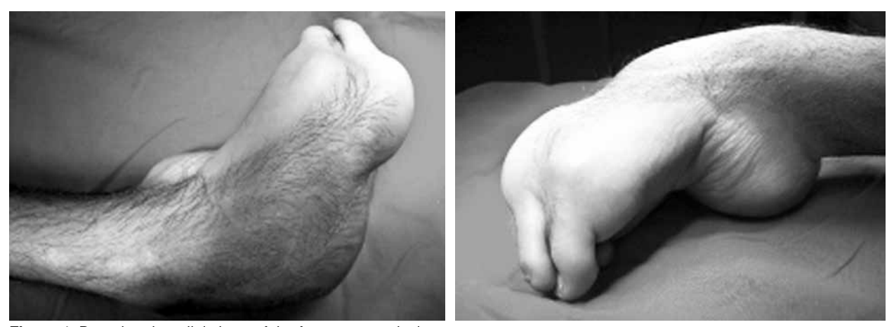
Figure 1. Dorsal and medial views of the foot preoperatively.

The half ring at the level of the hindfoot was fixed to the calcaneus by olived Kirschner wires (K-wires) with the olives being respectively placed medial and lateral. The half rings at the end of the