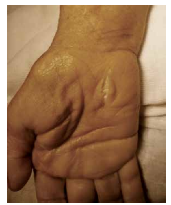
Figure 2. Incision for mini-open technique.

One centimeter transverse incision was performed between palmaris longus and flexor carpi ulnaris tendons over most of the determined proximal wrist crease (Figure 4). The direction of the blade was again