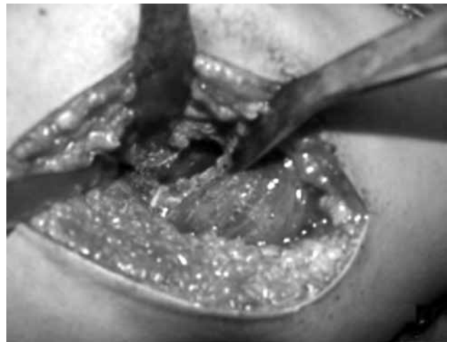
Figure 2. Window on the femoral neck to allow the emptying of the necrotic area and the placement of the graft.

In accordance with the postoperative protocol, the hip was positioned in 20° flexion for three weeks to relax the pedicle postoperatively. Subsequently, walking was permitted without any weight bearing for six months.