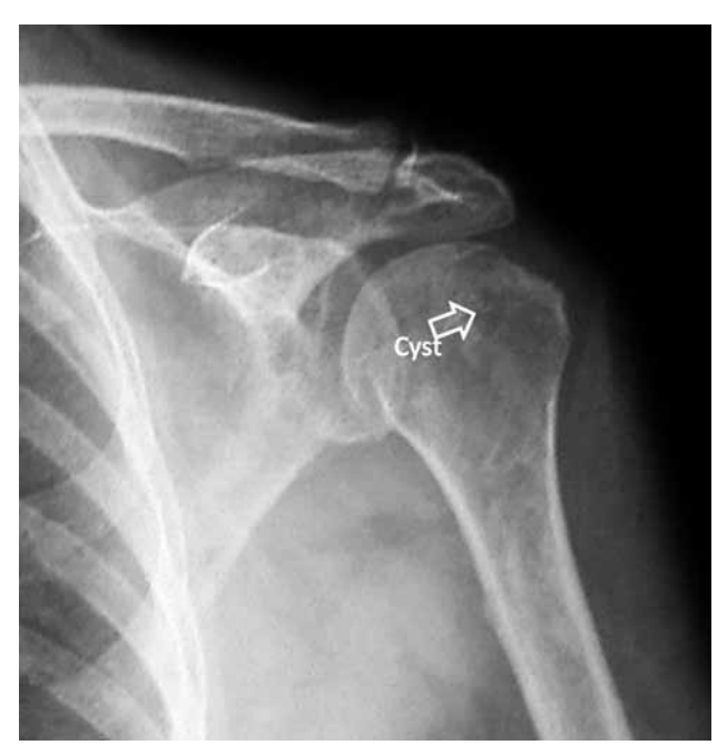
Figure 1. Plain X-rays facilitates localization of subchondral cycsts.

To our knowledge, there is no study comparing muscle atrophy of the rotator cuff, tear size, shoulder muscle strength, range of motion (ROM), pain, and upper extremity function between RCT patients with or without anterior greater tuberosity cyst (AGTC).