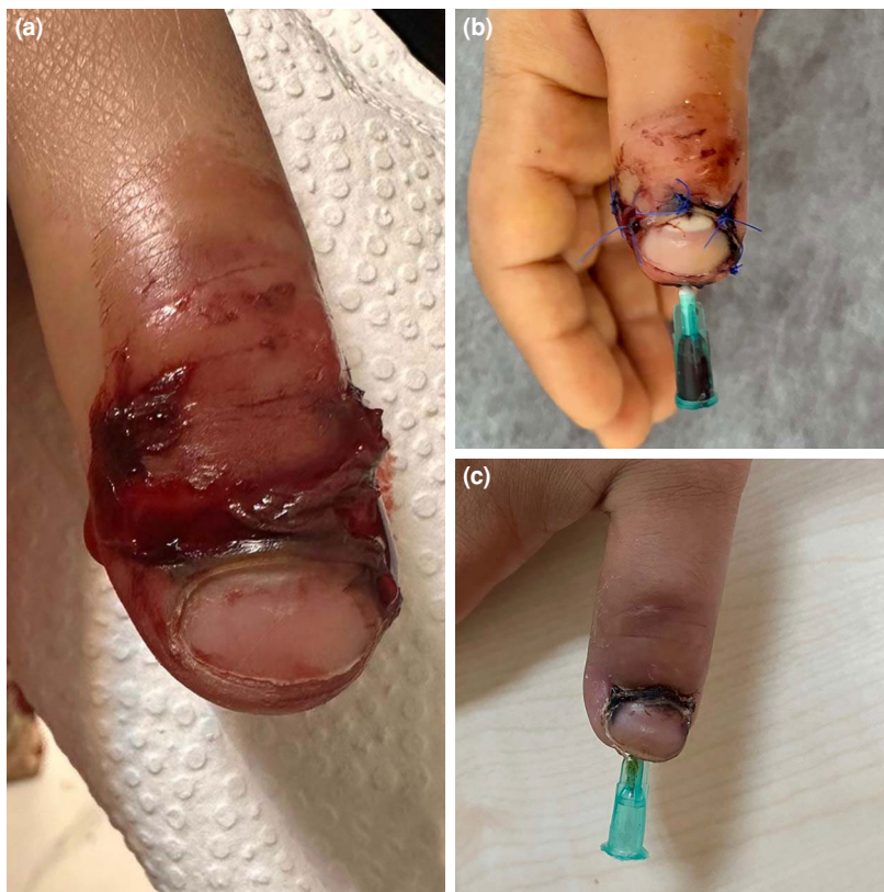
FIGURE 3. (a) Image of a patient presenting with a Seymour fracture of the 1 st finger of the left hand caused by a door-trapping injury, (b) Image at Week 1 postoperatively, (c) Image at Month 1 postoperatively.

The patients were evaluated in terms of the affected extremity side, and 11 (39.3%) patients had their right side affected, while 17 (59.7%) patients had their left side affected. Examination of the affected fingers revealed that the thumb was affected in 11 (39.3%) patients, the middle finger in nine (32.1%) patients, the little finger in three (10.7%) patients, the ring finger in three (10.7%) patients, and the index finger in two (7.1%) patients (Figures 1-3). There was no statistically significant difference in the affected side (right/left) and fingers ( p=0.43 and p>0.05 , respectively) (Table I).