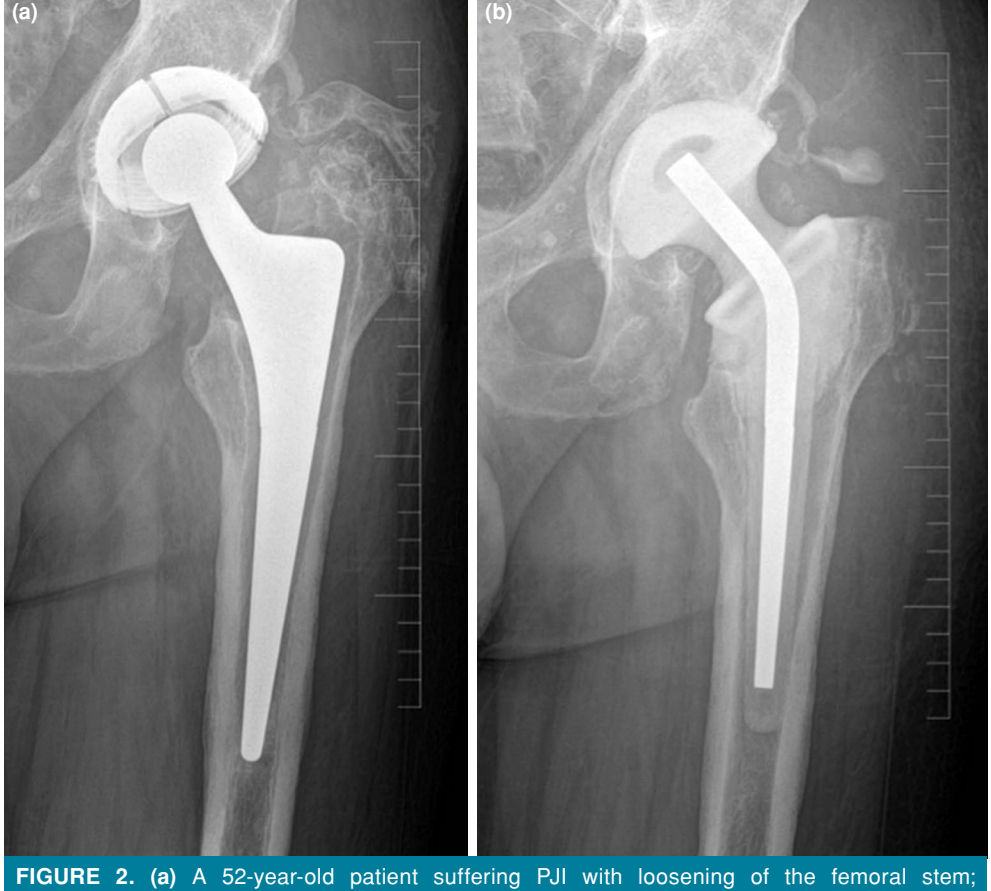
(b) prefabricated antibiotic-loaded hip spacer. PJI: Periprosthetic hip joint infection.

For the purposes of this work, we considered dislocation, breakage, and other spacer failures that required surgical intervention to be mechanical complications. Overall, a mechanical complication occurred 20 times, 10 times per type of spacer. A total of 16 dislocations were recorded, of which six were dislocations of C-spacers, and 10 were dislocations of P-spacers; the difference was statistically significant (p=0.0082). Moreover, we registered four spacer