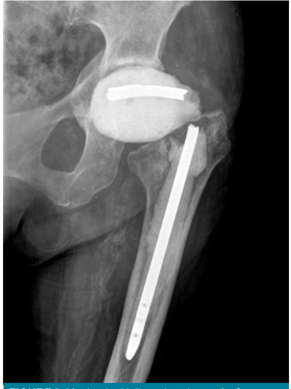
FIGURE 3. Mechanical failure - breakage of a C-spacer.

For this study, we consider an infectious complication to be a relapse or recurrence of an infection that was confirmed in the laboratory and required a revision procedure. A total of nine reinfection complications of spacers were registered; only one infection of P-spacers and eight infections related to C-spacers (p=0.2583). Definitive rTHA after spacer explantation and successful treatment of the infection occurred in 63 cases out of a total of 78 patients. Definitive rTHA occurred after the use of C-spacers in 41 (78%) patients and after the use of P-spacers in 22 (84%) patients. The difference between the results was not statistically significant (p=0.7816).