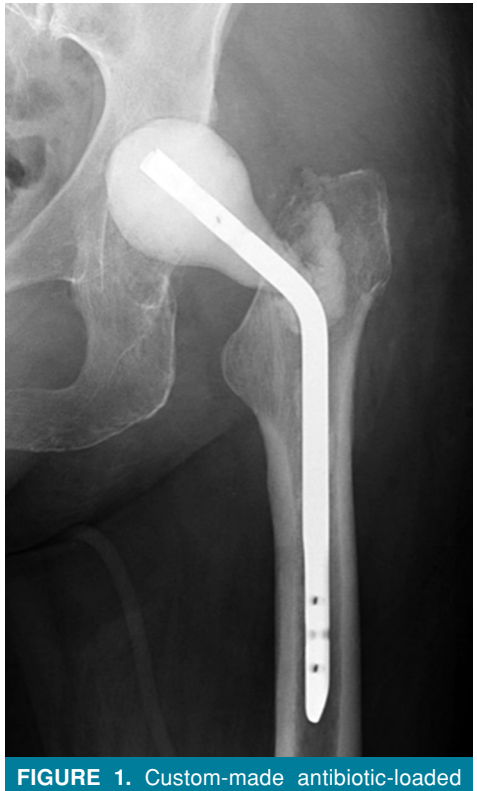
articular spacer modeled from bone cement and humeral nail in our department.

For effective infection control, a bactericidal concentration of antibiotics in the joint cavity needs to be sustained for as long as possible. The Synicem (Synergie Ingenierie Medicale, Chamberet, France) prefabricated spacer made of polymethylmethacrylate