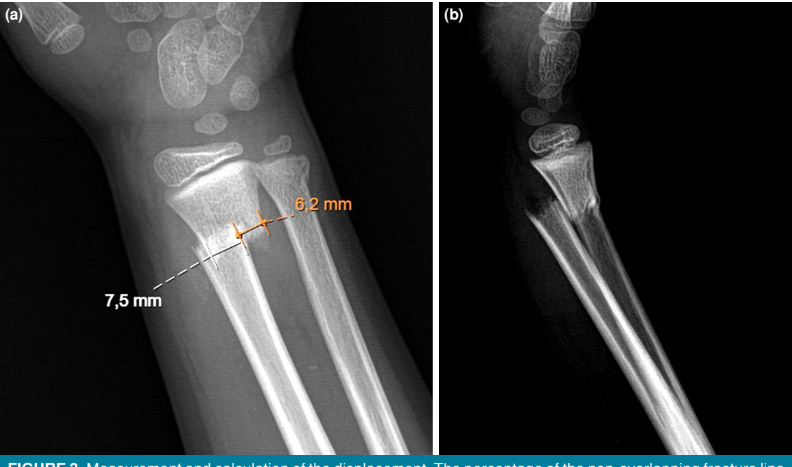
FIGURE 3. Measurement and calculation of the displacement. The percentage of the non-overlapping fracture line length in the total fracture line length was used to calculate the fracture displacement. (a) Example of the coronal displacement: 6.2/(6.2+7.5)\times100=45 . (b) Example of the sagittal displacement: this fracture was considered to be 100% displaced in sagittal plane, because it has a bayonet apposition and there is no overlapping of the fracture line in the sagittal plane.

When the radiological measurements were evaluated, there was no statistically significant difference between the angulation and translations of both groups in the sagittal and coronal planes at the time of admission to the ED. When the