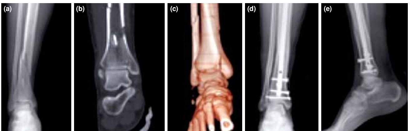
Figure 1. Twenty-two-year-old male with AO/OTA type 43C2 tibia fracture. (a) Preoperative anteroposterior X-ray, (b) preoperative lateral X-ray, (c) preoperative three-dimensional computed tomography, (d) postoperative anteroposterior X-ray at 28 th month, (e) postoperative lateral X-ray at 28 th month.

Mean Olerud and Molander score was 88±8.24 in functional results. A significant correlation between Olerud and Molander score and AO/OTA classification was detected. Olerud and Molander