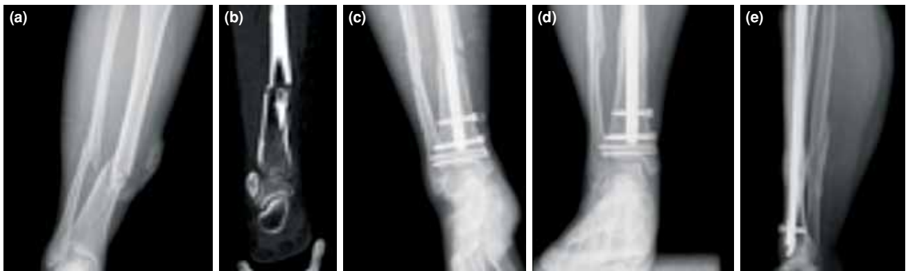
Figure 2. Thirty-eight-year-old female with AO/OTA type 43C2 tibia fracture. (a) Preoperative anteroposterior X-ray, (b) preoperative lateral X-ray, (c) preoperative computed tomography, (d) postoperative anteroposterior X-ray at 13 th month, (e) postoperative lateral X-ray at 13 th month.

score was significantly higher in the C1 fracture type ( p < 0.05 ) (Figure 3). The relationships between age, sex, wound status, smoking status, history of infection, and the number of screws and the Olerud and Molander score were not significant ( p > 0.05 ).