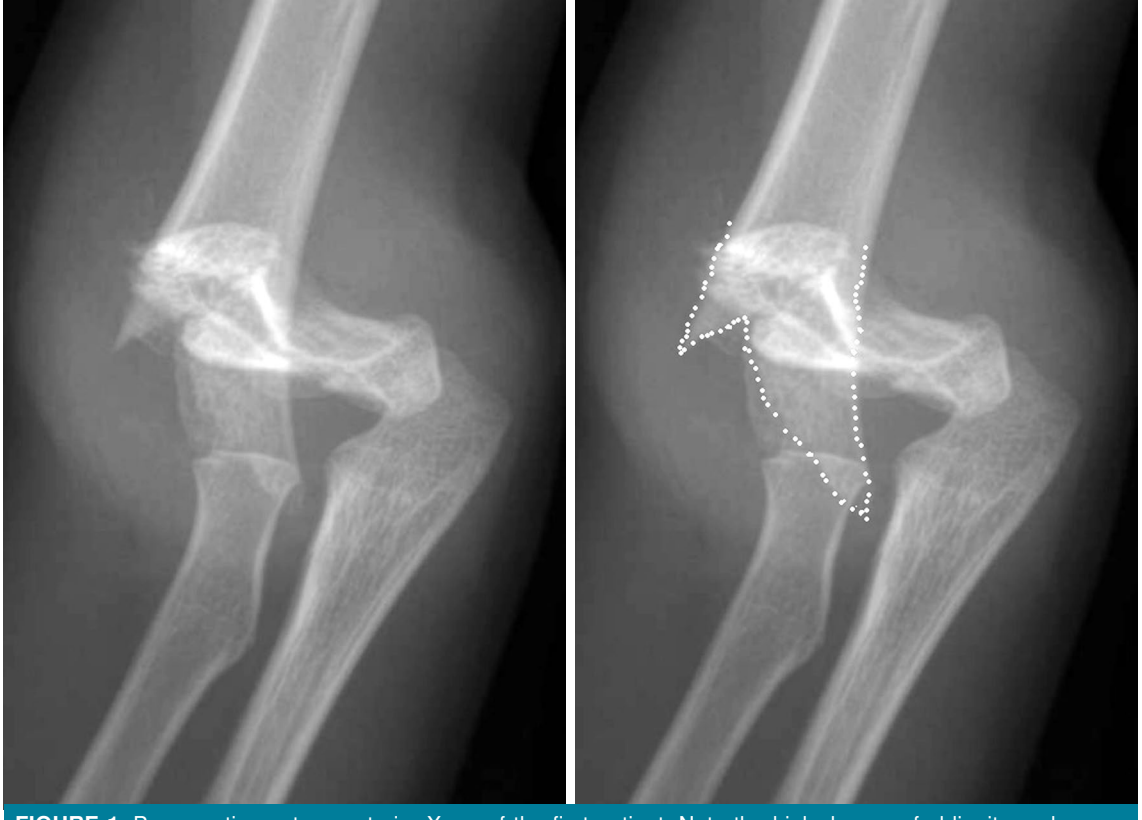
FIGURE 1. Preoperative anteroposterior X-ray of the first patient. Note the high degree of obliquity and a very sharp medial spike. Distal segment of the proximal fragment is marked to better delineate the fragment edges superposed on proximal radius.

The fracture was reduced and fixed with lateral divergent Kirschner wires (K-wires) under fluoroscopic guidance. High obliquity of the fracture made it impossible to achieve adequate bone purchase in the proximal fragment with a medial pin. The quality of reduction was checked by palpating the columns and visually inspecting the fracture line. Following stabilization of the elbow, cardiovascular surgeons joined the operation to check the vascular integrity. Although the brachial artery was intact, no pulse was present with Doppler in the radial and ulnar arteries in the wrist. There was no pulse in