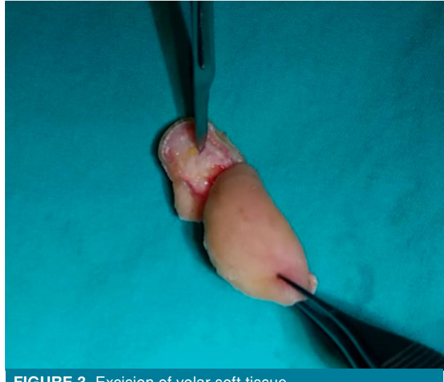
FIGURE 3. Excision of volar soft tissue.