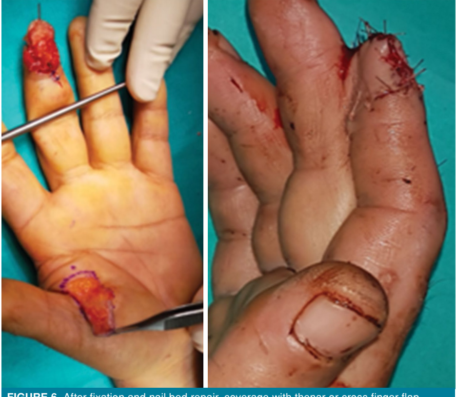
FIGURE 6. After fixation and nail bed repair, coverage with thenar or cross finger flap.

the amputated part consisting of the nail bed and bone, which would be used as a graft, was fixed to the stump with one or two K-wires or injector nail, without passing through the distal interphalangeal (DIP) joint (Figure 5). After nail bed repair, the coverage was provided with a cross finger or thenar