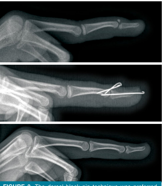
FIGURE 3. The dorsal block pin technique was preferred, when the fragment involved 30 to 40% of the joint surface. One or two K-wires were inserted through the terminal extensor tendon into the middle phalanx, just behind the fragment under lateral-view fluoroscopic imaging. If the reduction provided by the extension block pin was adequate, a second K-wire was inserted across the distal interphalangeal joint. K-wire: Kirschner wire.

When the fragment size was close to 50% of the joint surface, it was difficult to insert the DIP