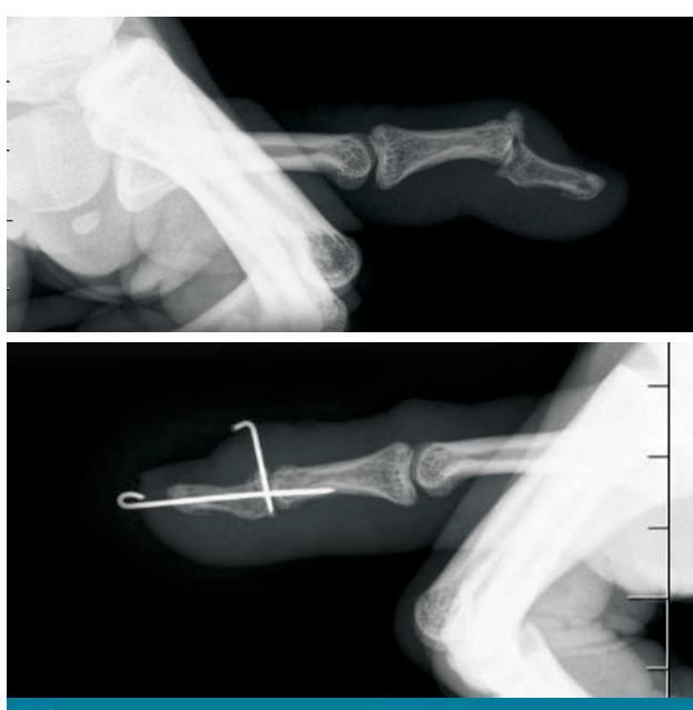
FIGURE 4. Direct fragment fixation method was preferred, when the fragment size was close to 50% of the joint surface.

In all patients, postoperative proximal interphalangeal joint and metacarpophalangeal joint movements were started immediately. No splint or brace was needed after surgery. At the end of six weeks, the K-wires were removed and the patients were referred to the hand therapists. At the final follow-up visit, the presence of union and osteoarthritis were evaluated by radiography.