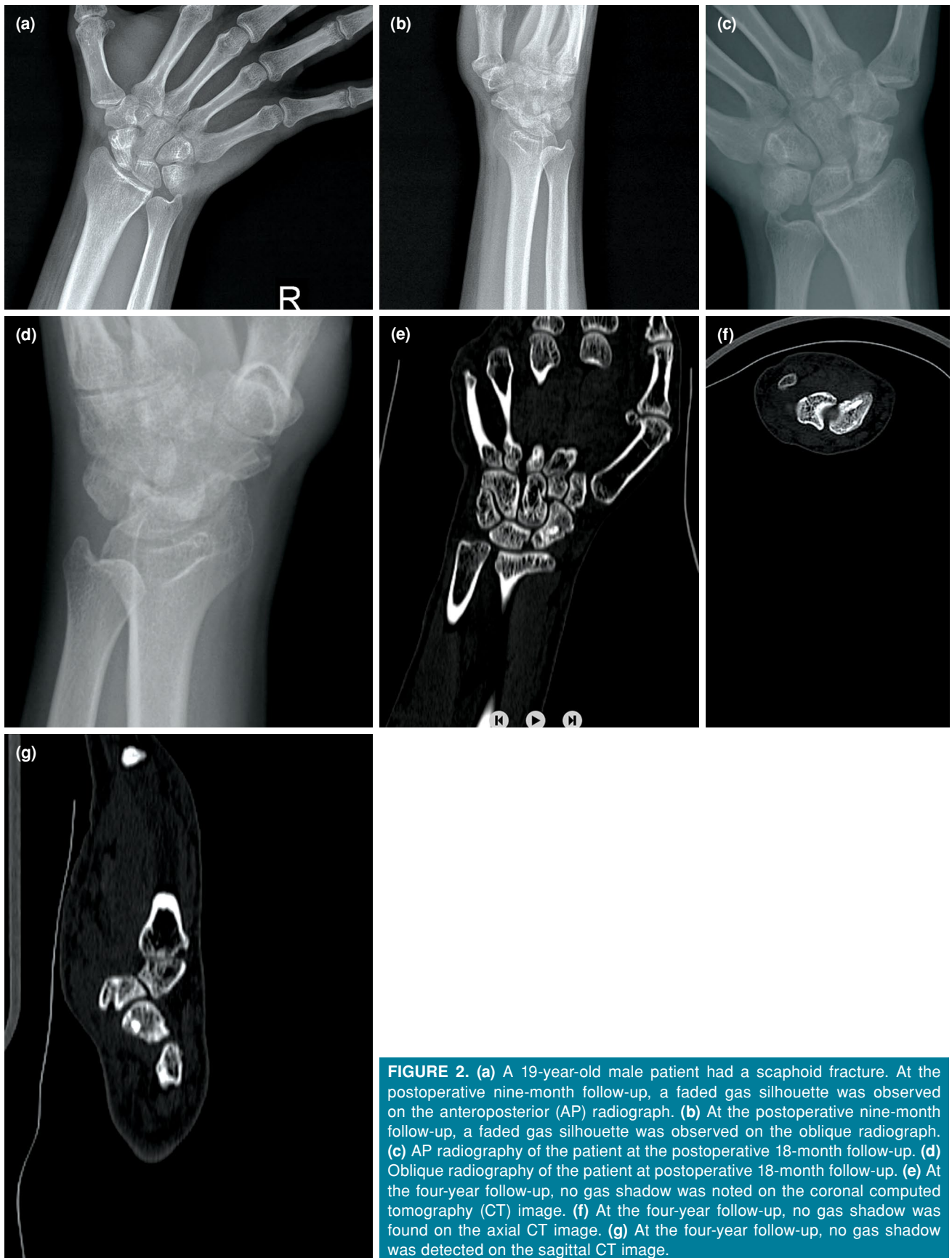
FIGURE 2. (a) A 19-year-old male patient had a scaphoid fracture. At the postoperative nine-month follow-up, a faded gas silhouette was observed on the anteroposterior (AP) radiograph. (b) At the postoperative nine-month follow-up, a faded gas silhouette was observed on the oblique radiograph. (c) AP radiography of the patient at the postoperative 18-month follow-up. (d) Oblique radiography of the patient at postoperative 18-month follow-up. (e) At the four-year follow-up, no gas shadow was noted on the coronal computed tomography (CT) image. (f) At the four-year follow-up, no gas shadow was found on the axial CT image. (g) At the four-year follow-up, no gas shadow was detected on the sagittal CT image.