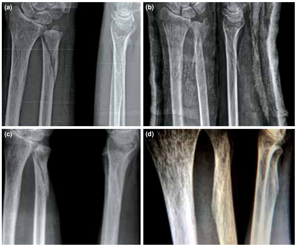
Figure 1. (a) Anteroposterior and lateral radiograms showing distal ulna fracture. (b) Anteroposterior and lateral radiograms showing distal ulna fracture in a splint. (c) Anteroposterior and lateral radiograms showing distal ulna fracture six weeks later. (d) Anteroposterior and lateral radiograms showing solid union of distal ulna fracture three months later.

meniscal tear in central region of the right knee (Figure 2a).