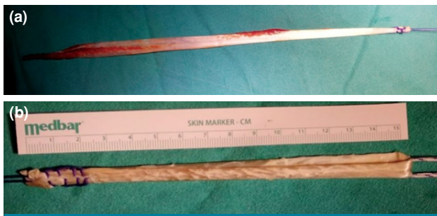
FIGURE 2. Preparation stages of peroneus longus tendon autograft. (a) The first form of graft after harvesting. (b) Graft ready to be placed in femoral and tibial tunnel.

and the knee was arthroscopically entered. The diagnosis of an ACL rupture was, then, confirmed.